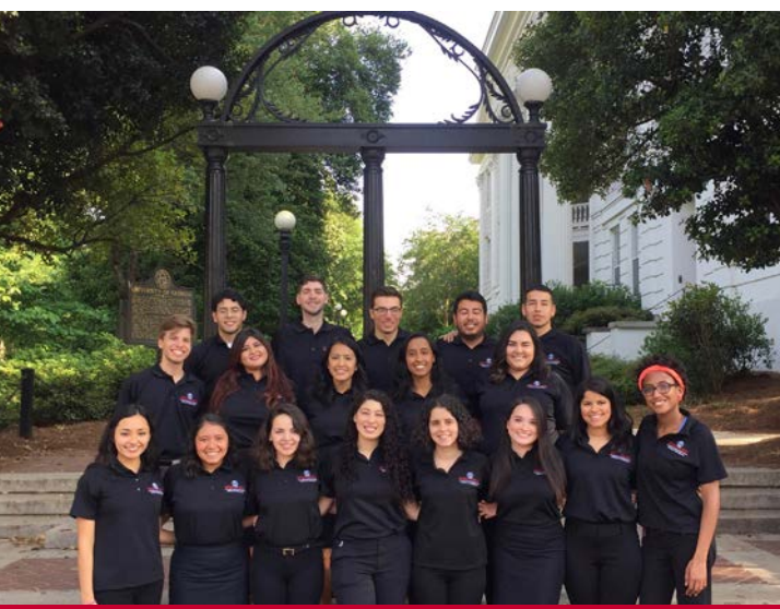
The Goizueta Ambassadors serve as campus and community leaders

One of the initiatives derived from the Goizueta foundation is the Goizueta Ambassadors Program. This year 15 outstanding students are participating in the program, through which they serve as leaders on campus and in the community. Along with engaging in leadership events on campus, they participate in a variety of outreach programs that inspire prospective students.