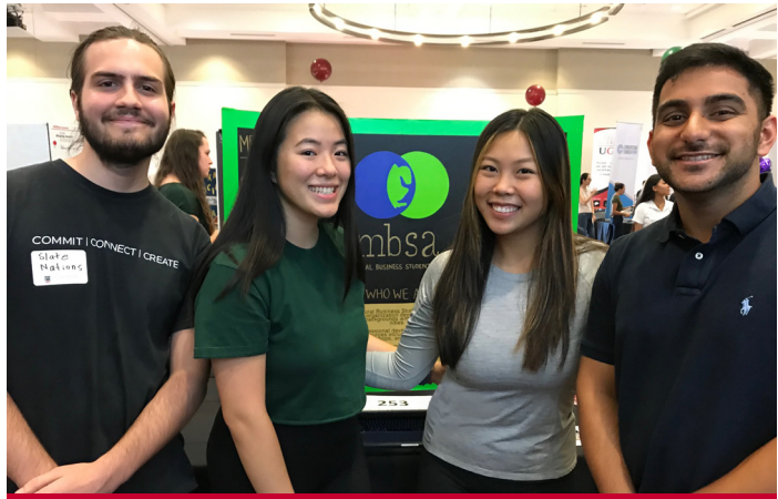
Members of MBSA at the Involvement Fair for student organizations

DIVERSITY AT UGA • Fall 2019 DIVERSITY AT UGA • Fall 2019