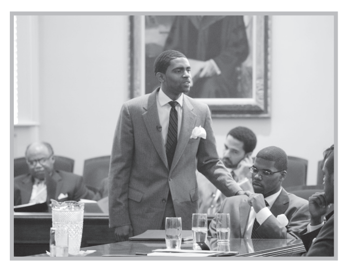
Members of the Black Law Students Association organized and participated in a re-enactment of the Holmes v. Danner case that led to UGA's desegregation.