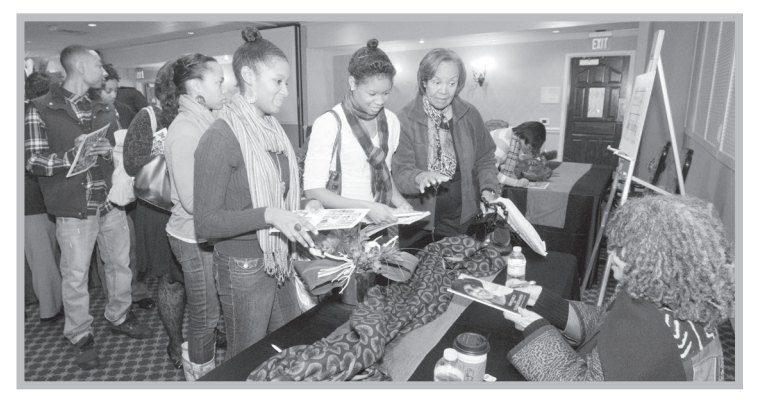
Several book signings allowed students and others a chance to meet featured guests. (Peter Frey)